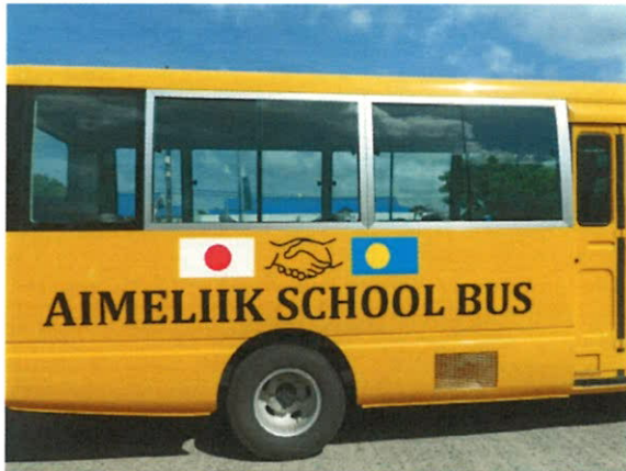
Side view of Aimeliik School Bus