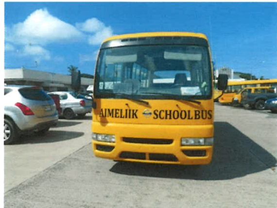
Front view of Aimeliik School Bus

The school bus for Aimeliik Elementary School arrived in Koror in mid July 2017 followed by a turnover ceremony on August 03, 2017. The bus has been turned over to Aimeliik Elementary School and is now being used to transport Aimeliik Elementary School students to and from school, including other school activities outside of the school campus.